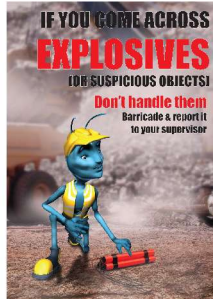
A018 - Explosives

IF YOU COME ACROSS EXPLOSIVES [OR SUSPICIOUS OBJECTS] Don't handle them! Barricade & report!! to your supervisor