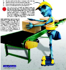
A015 - Conveyor Safety