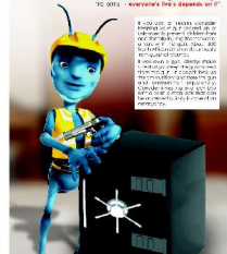
A016 - Gun Safety

Remember that it is the responsibility of every worker to: • Keep guns locked in a secure container. • Only use guns when authorized. • Never use guns for anything other than their intended purpose. • Never use guns in a reckless or careless manner. • Never use guns in a way that could cause injury or damage. • Never use guns in a way that could cause embarrassment or ridicule. • Never use guns in a way that could cause harm to the environment. • Never use guns in a way that could cause harm to the community. • Never use guns in a way that could cause harm to the world.