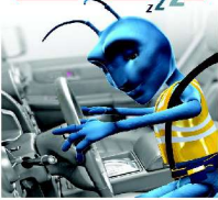
A013 - Driver Fatigue

It is a common mistake to think that fatigue is just a lack of sleep. In fact, it is a complex condition that can be caused by a number of factors, including lack of sleep, long hours of work, and a diet of fast food. Fatigue can lead to a number of safety hazards, including: • Decreased alertness and reaction time • Impaired judgment and decision-making • Increased risk of accidents and injuries • Decreased productivity and efficiency