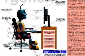
A014 - Tips for Office Ergonomics

These are basic rules that no operator whose conveyor is utilized should ignore. Adhering to these rules is the most cost-effective way to avoid all conveyor safety programs.